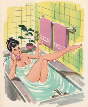
"... and when he started to get fresh, I slapped him clear out of bad?"