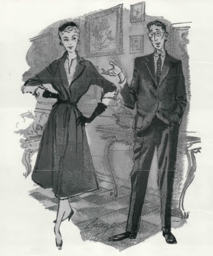
"Love is like a beautiful edifice, Miss Cartwright — it must be built up a little piece at a time."