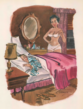
"What kind of living would we make if \underline{I} staged in bod all day?"